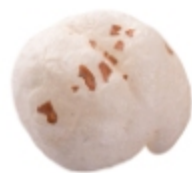
GRADE - 6

At the heart of our commitment to providing the finest makhana lies a range of grades in the raw makhana category. Each grade represents a distinct size, ensuring that you have the flexibility to choose the perfect fit for your preferences. Our diverse selection ensures your customers have access to all possible grades and their blends. We understand the varied preferences within market, and our range is crafted to meet the unique needs of your business.