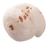
GRADE - 5